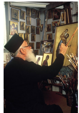
Traditional Icon Painting

The Akamas Peninsula – Explore one of the wildest least disturbed areas of the island, largely protected today as a nature reserve. Slip back in time to a majestic, scenic, tranquil, and largely undeveloped Cyprus.