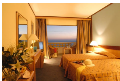
A Standard Twin Room