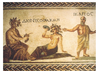
An Ancient Paphian Mosaic