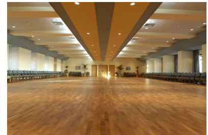
The Athena Royal Main Ballroom