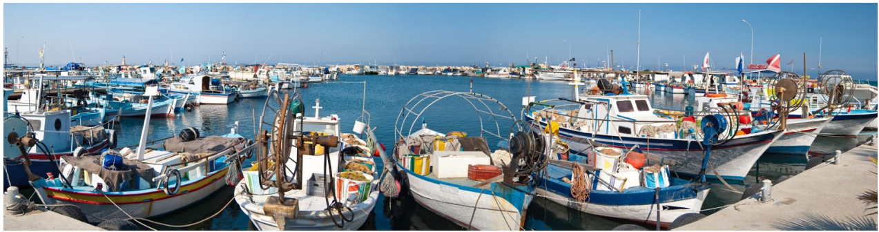
Fishing Boats In Paphos Harbour